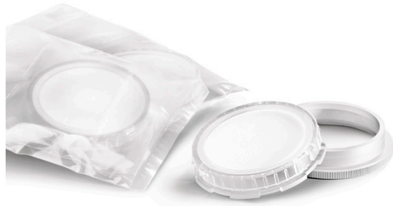
Gelatine membrane filter

Gelatine membrane filters are unique in being a water soluble filter, which was purpose-built for quick and reliable sampling followed by easy storage and sample preparation of viruses and other pathogens.