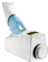
Active on-site air sampling