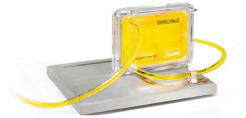
Vivaflow® tangential flow cassettes for samples from 50 mL to several liters