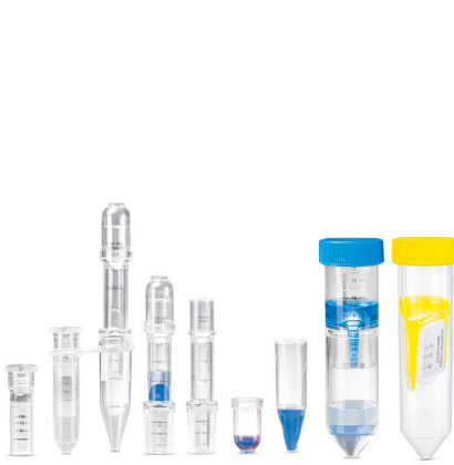
Vivaspin® centrifugal ultrafilters for 100 µL to 20 mL samples

The product range includes several membrane materials and molecular weight cut-offs (MWCO) to cover a wide variety of applications.