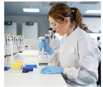
Extraction and PCR amplification

Sartorius supports your wastewater sample preparation workflow with streamlined solutions for particle removal and concentration of SARS-CoV-2 particles and genomic RNA..