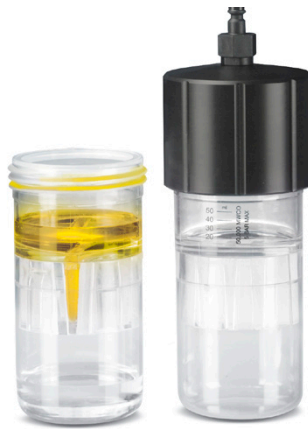
Vivacell® centrifugal or pressure-driven devices for 20 mL to 100 mL samples