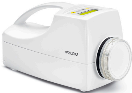
Airport MD8 air sampler

With the help of the portable Airport MD8 air sampler, the air of all high-contamination risk areas can be sampled to detect the presence of the coronavirus.