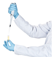
Extraction and PCR amplification

The unique Sartorius gelatine air filters combined with patented membrane-dissolving technology enable you to detect every single virus that was retained on your membrane.