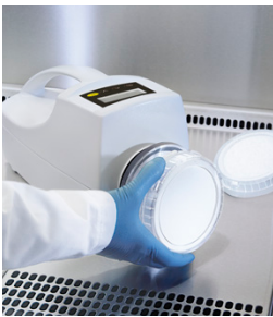
Preparation for sampling